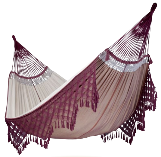
Family Hammock Bossanova bordeaux BSH18-7