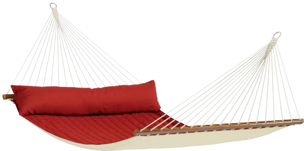
Kingsize hammock with spreader bar Alabama red pepper NQR14-21